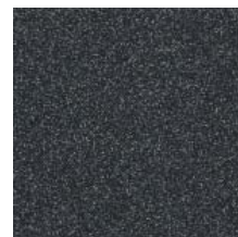
Galaxy Nebula F635QW