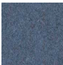
Navy Legacy 4651-60