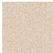
Tan Nebula F626QW