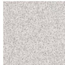
Ivory Nebula F607QW