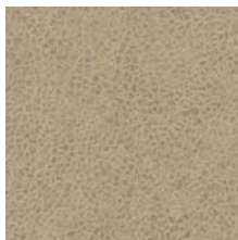
Western Suede 4871-60