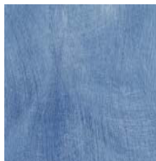
Woolamai Brush 4746-60