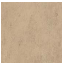
Tan Soapstone 4887-38